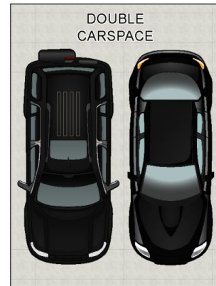
(NOT IN POSTION)