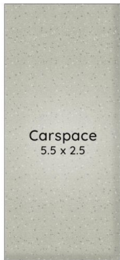
:: FLOOR PLAN Basement